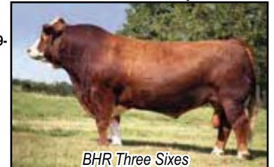
BHR Three Sixes

KYKSO HADAU BHR RAZIYA SA L087E US_2135981- RENMOR WP8647 88