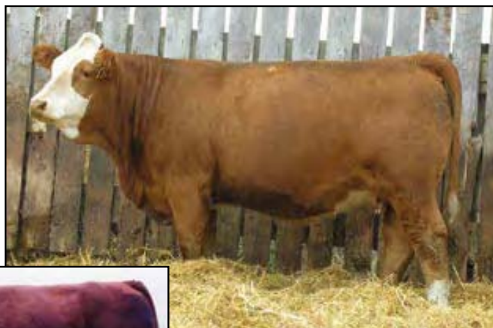
Anchor "T" Metro