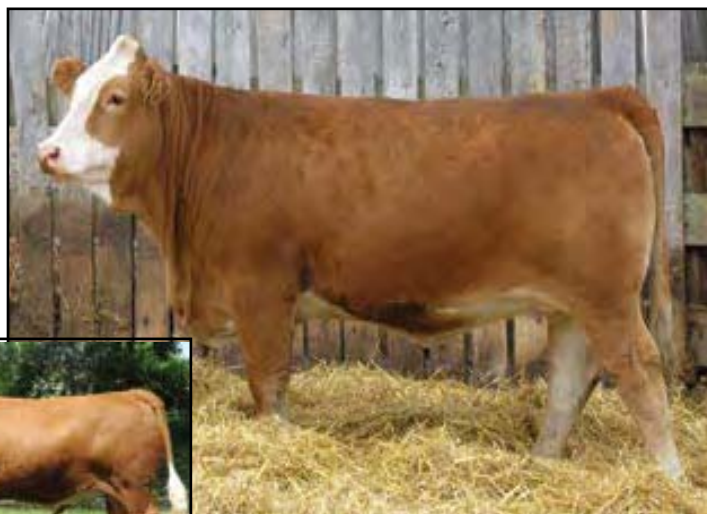
Double Bar D Everest 4R